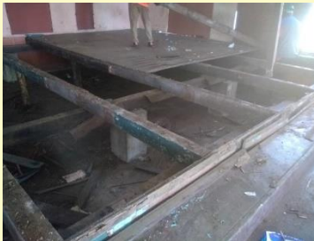
Dismantling of stage floor