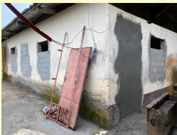
Securing of storage facility at rear of hall (Closing of windows and door) - A