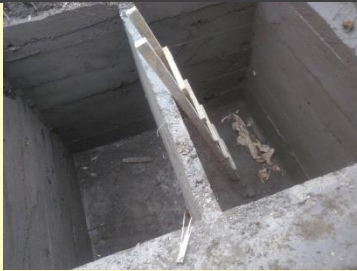
Improvement of septic tank