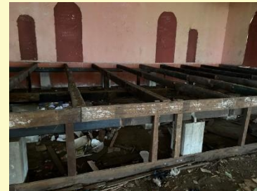
Deteriorated stage support