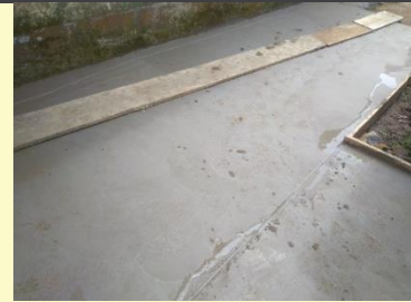
Concreted floor in front of toilets