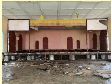
Stage after dismantling of wooden floor