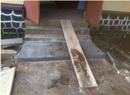
Improvement of main entrance