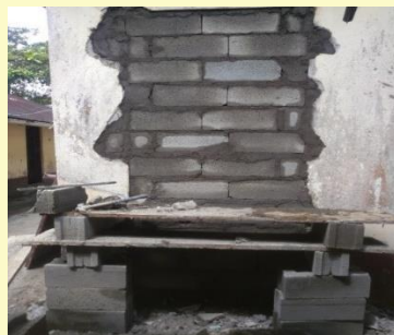
Securing of storage facility at rear of hall (Closing of windows and door) - B