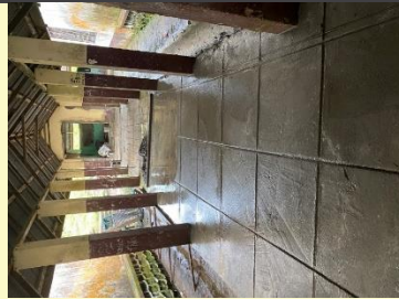
concrete walkway to urinary