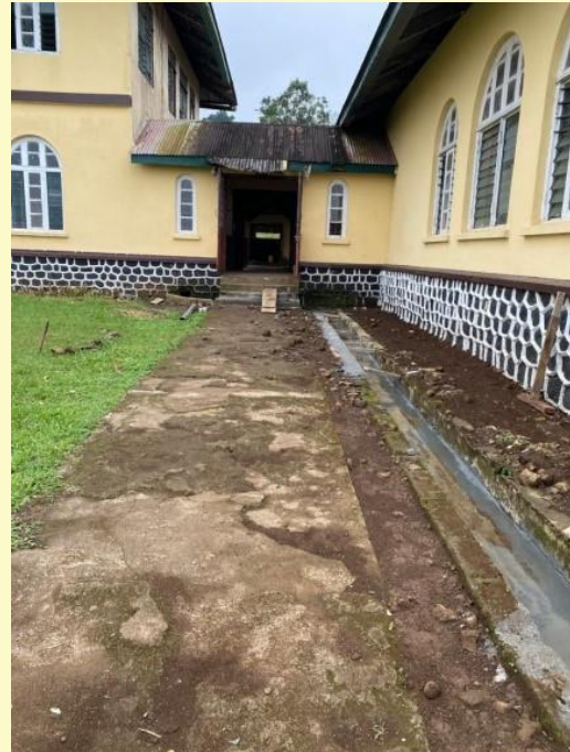
Improvement of drainage at entrance